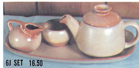
6J SET 16.50