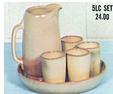
5LC SET 24.00