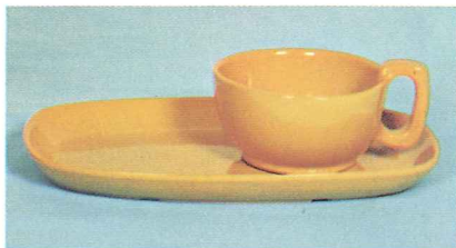
SOUP AND SANDWICH SET 4SC—11 OZ. SOUP CUP 3.75 6P—11" PLATTER-TRAY 4.50