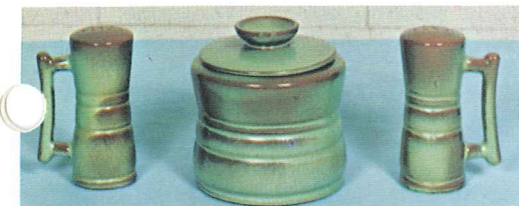
26G—SUGAR/GREASE 26H—SALT & PEPPER 9.25 6.00 26GH—4-PIECE SET/BOXED 15.00