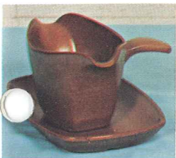
6S—TWO-SPOUT GRAVY 6.50 5PS—9" PLATTER-TRAY 3.75 6S/ST—TWO-SPOUT GRAVY/W TRAY 10.00