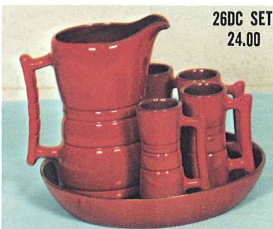
26DC SET 24.00