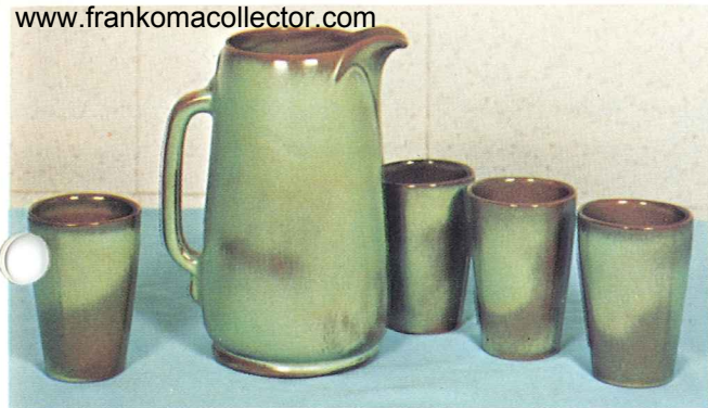
9.25 80—2 QT. PITCHER 5L—12 OZ. TUMBLER 3.75