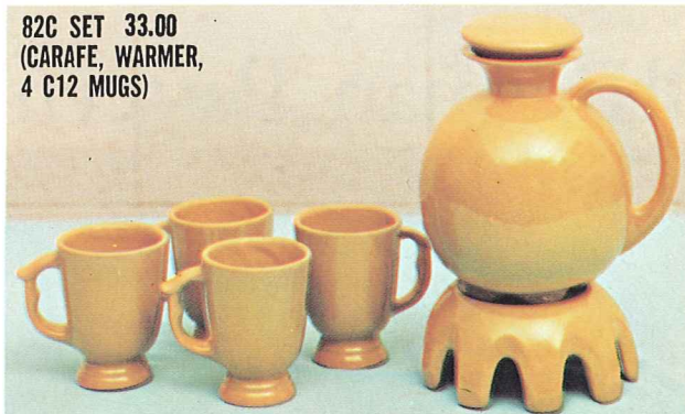
82C SET 33.00 (CARAFE, WARMER, 4 C12 MUGS)